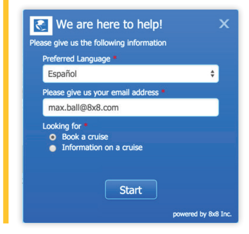
Chat in your language of choice.