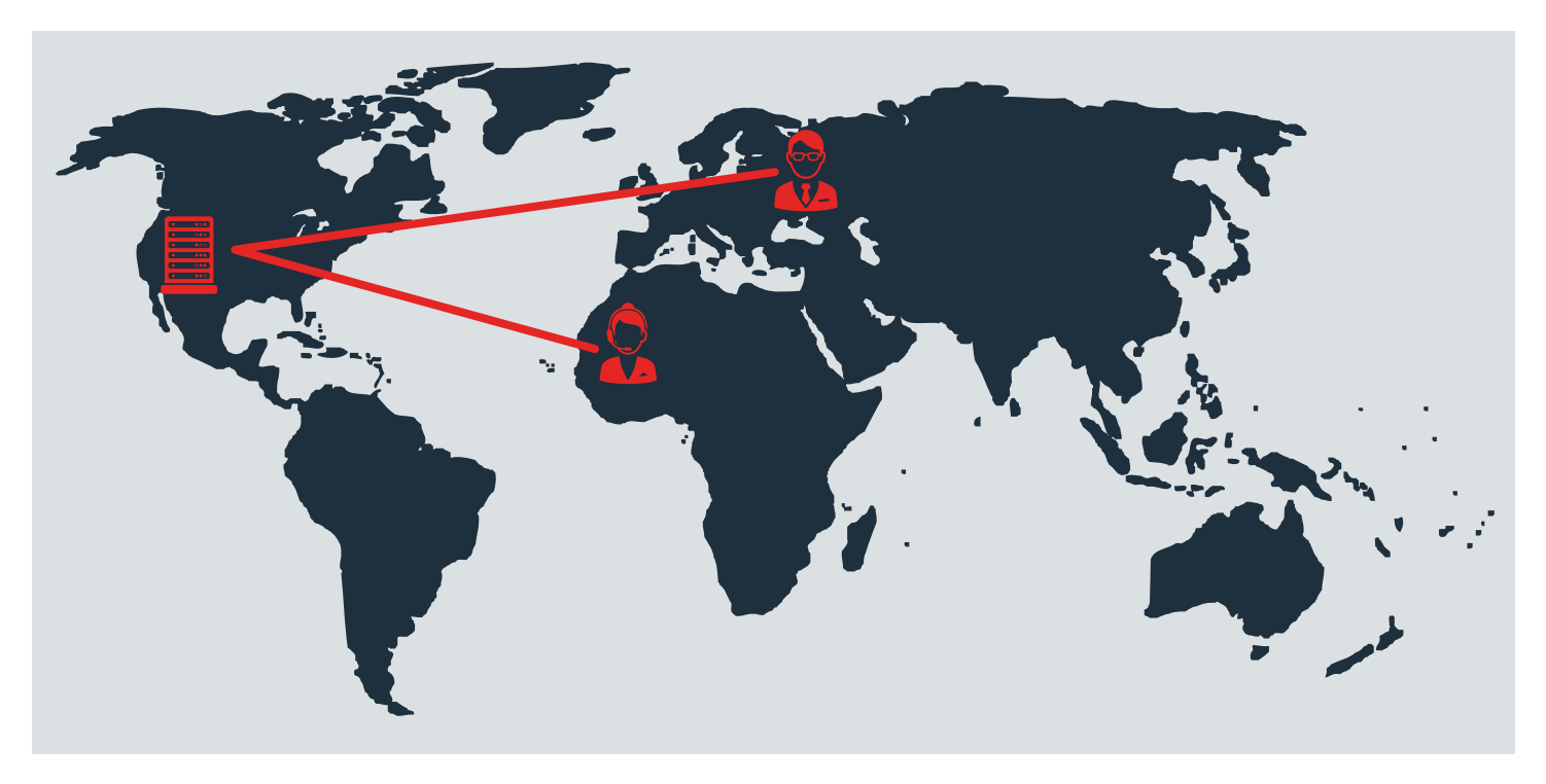
If your cloud contact center vendor only has a few data centers, hairpinning will create call quality issues that impact agent/customer interactions.

Cloud contact center vendors often serve customers worldwide from a single data center location. In this case, calls often travel around the world and back, even if they are connecting callers to local agents. The term hairpinning is used to describe a situation where telephony traffic reaches a router from a given source, makes a U-turn and goes back the way it came. Visually this process looks something like a hairpin.