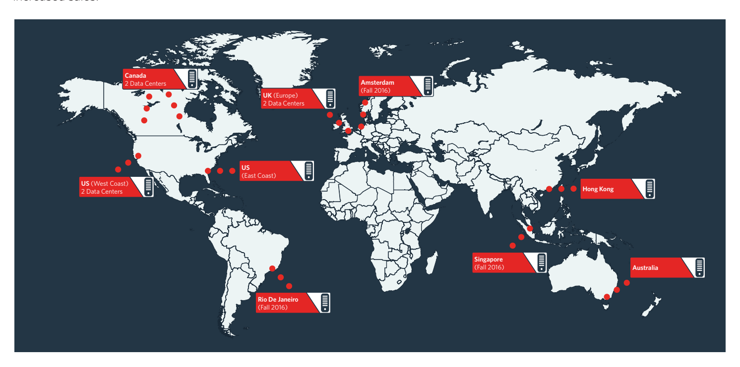
8x8's global data centers ensure consistent call quality.

8x8 has 12 data centers worldwide, so no one is ever too far away. Regional calls stay regional, with no latency. The result: premium call quality, every call. 8x8 customer, EasyRoomate / Vivastreet is a global company with contact centers in the UK, Morocco, Madagascar, Brazil and Russia. Being able to provide a local presence to support customes who a developing ads for their site has increased sales.