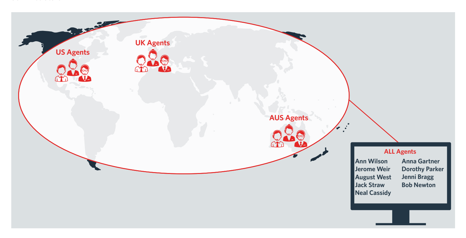
Only 8x8 Virtual Contact Center bring together all your agents under one global contact center with unified reporting, monitoring and management.

The 8x8 Virtual Contact Center delivers the best of both worlds. All telephone connections can be handled locally to ensure high-quality interactions and control telephony costs. At the same time, now you can manage your distributed contact center as a single team with one set of administrative functions, one set of reports and one configuration tool. All your agents share the same management controls regardless of location. Your customers gain a consistent experience around the globe. 8x8 customers with contact centers across multiple countries and sites have been able to reduce headcount by eliminating the need for local administrators.