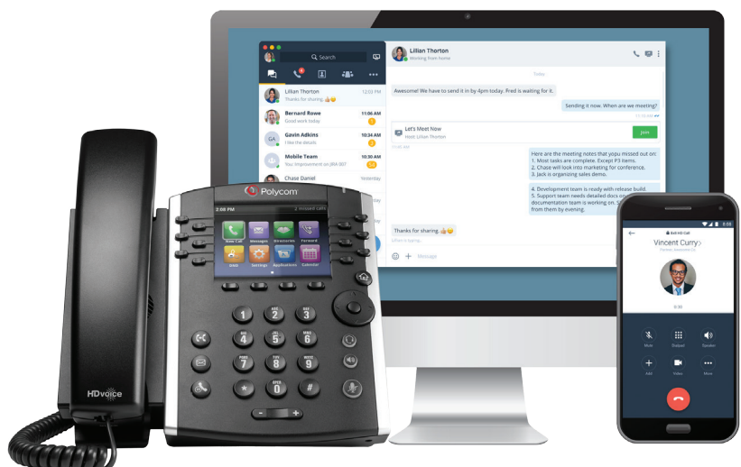
8x8 Virtual Office