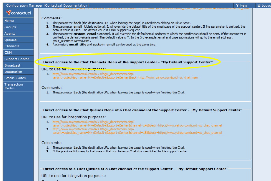
Figure 3: Support Center page, Direct URL tab, Direct access to the Chat Channels... area

If the OnDemand Contact Center supports more than one Support Center, be sure to copy the URL of the correct support center channel.