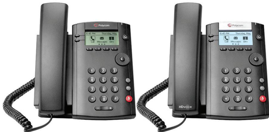
Polycom VVX 101 and Polycom VVX 201